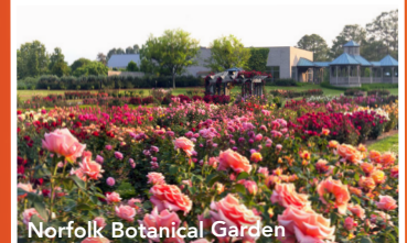
Norfolk Botanical Garden