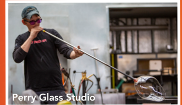
Perry Glass Studio